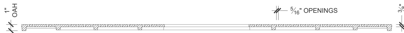
Longitudinal Section Scale: 1 1/2" = 1' 0"