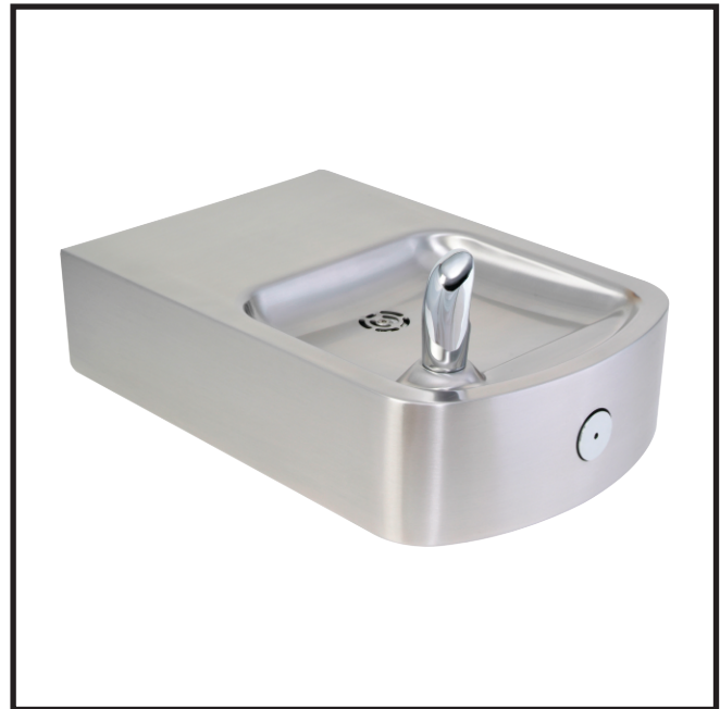
Stainless Steel Model: GSE64-FG

Model GSE64-FG is a wall mounted, vandal resistant drinking fountain made from 14 gage, 304 stainless steel with a brushed finish. Unit shall be activated by a self-closing, front push button, by using less than 5 pounds of force, which activates an internally mounted valve with an adjustable stream regulator controlling the water flow. Bubbler shall be polished chrome plated brass with a non-squirt feature and operate on water pressure range of 20-105 psig. Unit shall have a uniquely designed, contoured bowl with P-trap behind the wall. Unit shall adhere to ANSI A117.1 and Americans with Disabilities Act of 1990 frontal approach and protruding objects requirements, Child ADA parallel and frontal approach and CHSC 116875.