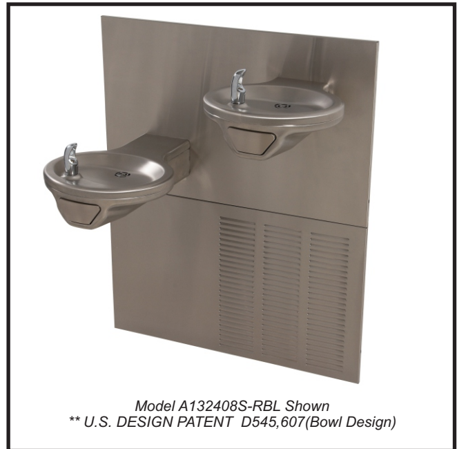
Model A132408S-RBL Shown ** U.S. DESIGN PATENT D545,607(Bowl Design)

Please visit www.murdockmfg.com for most current specifications.