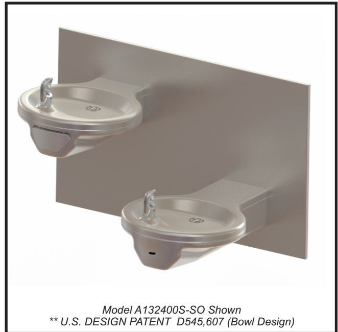
Model A132400S-SO Shown ** U.S. DESIGN PATENT D545,607 (Bowl Design)